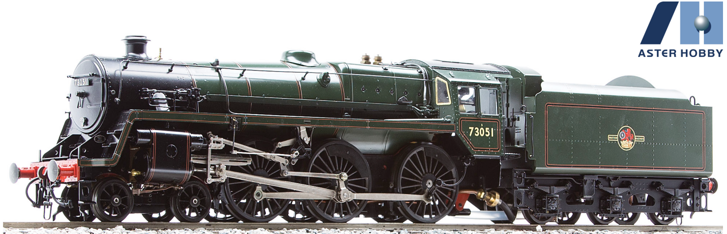
ENGINEERING SAMPLE SHOWN

Robert Riddles was tasked to produce new standard locomotive designs for the fledgling British Railways, totalling 12 new classes. The BR 5MT was based on the very successful LMS 'Class 5' mixed traffic design, the 'Black Five' introduced in 1934. However the BR 5MT had the advantage of nearly 20 years progress in steam locomotive development. Consequently the general layout for crew comfort, ease of disposal and shed maintenance were all much improved.